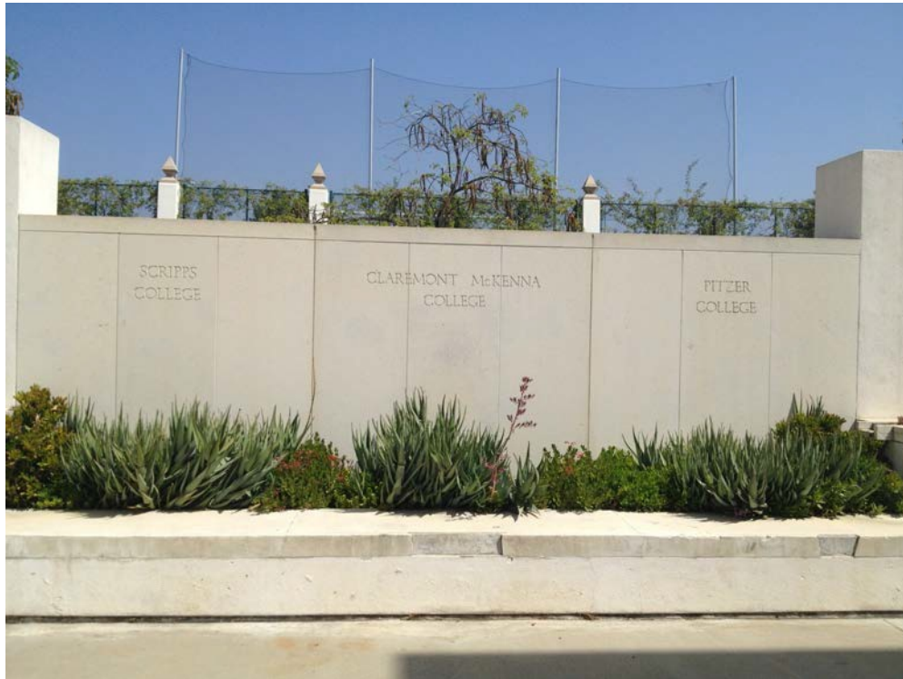
Figure 2: Photograph of signage showing intersection of the Scripps College, Claremont McKenna College, & Pitzer College campuses

students between campuses, was in stark contrast to the research team’s experience at Five Colleges, Inc. where individual schools did not offer guidance or directions to sister institutions, even when asked directly for help navigating between campuses.