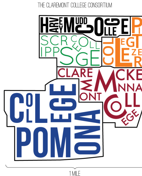
Figure 1: Stylized map of the Claremont Colleges showing the interlocking campus design, created by Pomona Student Stacey Abrams (From: http://staceyabrams.strikingly.com/ )

know that you had moved to another school. As noted in a Scripps Information Session, “things are so close that it’s usually the architecture that helps signal that you are on another campus – each has a very different feel.”