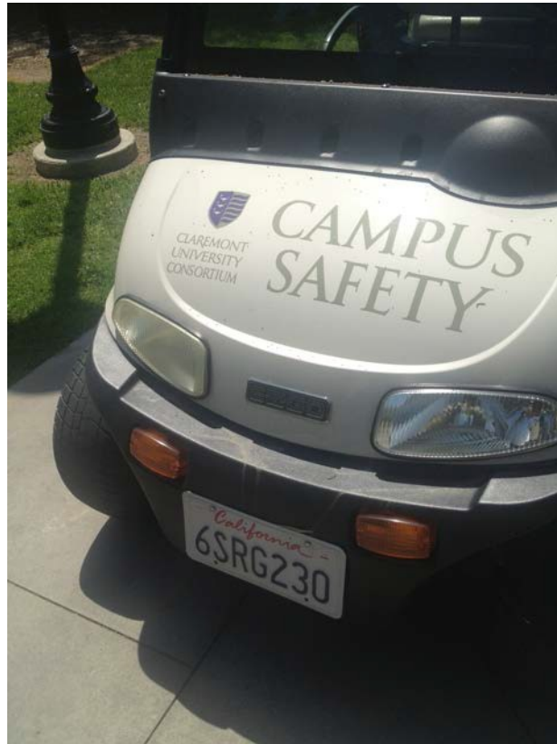
Figure 8: Photo of Branding on a CUC Safety Van

The Claremont University Consortium has a brand identity and a logo (Figure 7) that not only adorns campus buildings but also appears on consortial resources like the campus safety vans (Figure 8). These visual markers highlight the intended communal use of certain campus locations and resources, and also remind students at each of the institutions that they are part of a greater community.