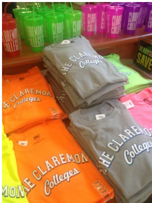
Figure 9: Photo of branded Claremont Colleges items at the Huntley Bookstore

Having a logo for the consortium and offering branded consortium merchandise are simple reminders that the individual institutions, each with their own distinct character and strengths, are also an important part of a collective group of schools that offers something unique in the educational terrain.