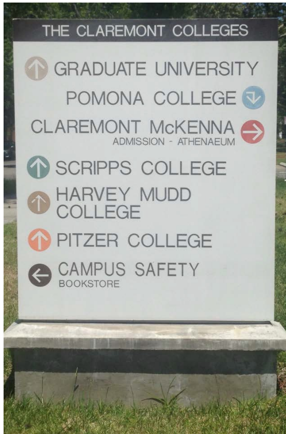
Figure 3: Photograph of TCC Signage located outside of the Honnold-Mudd Library

hard to navigate on her own when there was a short transfer time between courses or activities.