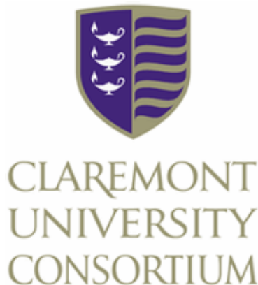
Figure 7: Claremont University Consortium Logo